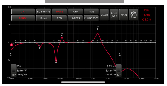
Mute individual channels for ease of setup and reset buttons of you need to return to default settings.