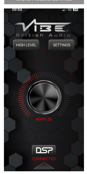
Controls the master volume for all channels from the home page of the DSP amps

Below details all the functions of the DSP app.