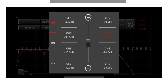
Audio limited is similar to a compressor and allows the user to keep the signal for each channel consistent. Limit level (dB) attack (ATK) \, and Releaser (RLS) are all adjustable for each individual channel.