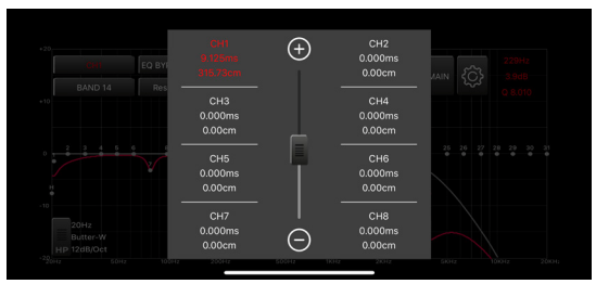
Time alignment allows each individual channel to be adjusted independently in either time (ms) or distance (cm)