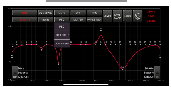
31 Band equaliser adjustable with your fingertips, gestures allow full control over both frequency and Q factors