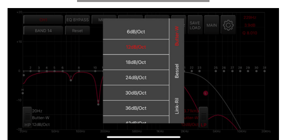
Active crossover allows HPF(high pass filter), LPF (low pass filter) and BPF (band pass filter) with the full 20Hz-20Khz available to all bands. The crossover slope is also variable between 6dB and 48dB Octaves.